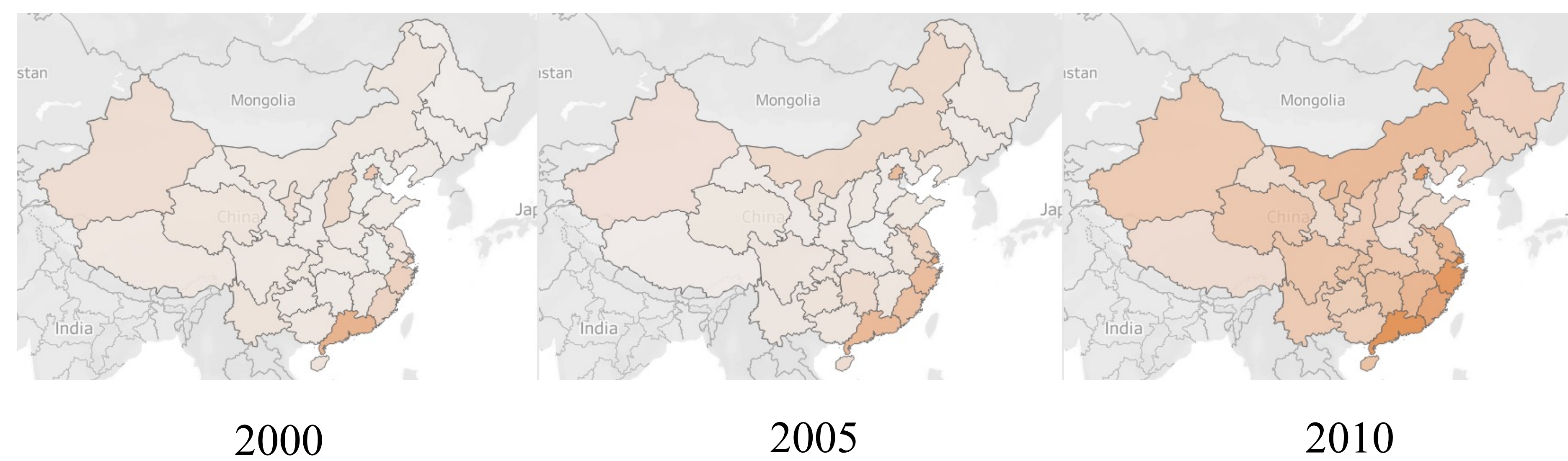
Proportion of Rural Migrants in All Workers